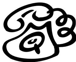
Caption describing picture