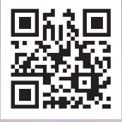
SCHOOL OF NURSING & HEALTH PROFESSIONS

** - For more information on the graduate degree program, please call 256-726-8391.