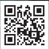
SCHOOL OF RELIGION

↖ Scan the codes to check out videos for each school.