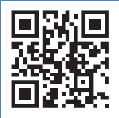
SCHOOL OF ARTS & SCIENCES