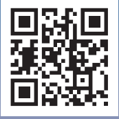
SCHOOL OF BUSINESS AND ADULT & CONTINUING EDUCATION

AS Art/Commercial Art AS Art/Photography BA Communication Media: Broadcast Journalism BA Communication Media: Photojournalism BA Communication Media: Print Journalism BA Communication: Communication Arts BA Communication: Public Relations BA Computer Networks BA English BA English/Professional Writing BA Mathematics BA Music: Composition BA Music: General Music BA Music: Instrument BA Music: Piano BA Music: Voice BA Psychology BA Spanish BM Music Composition and Recording Arts BM Vocal Performance and Pedagogy BS Applied Mathematics BS Biochemistry BS Biological Science BS Biology BS Chemistry BS Chemistry/Chemical Engineering BS Computer Science BS Mathematics BS Psychology